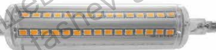
VAN LED 10W R7s